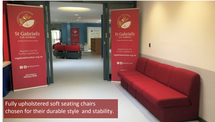
Fully upholstered soft seating chairs chosen for their durable style and stability.