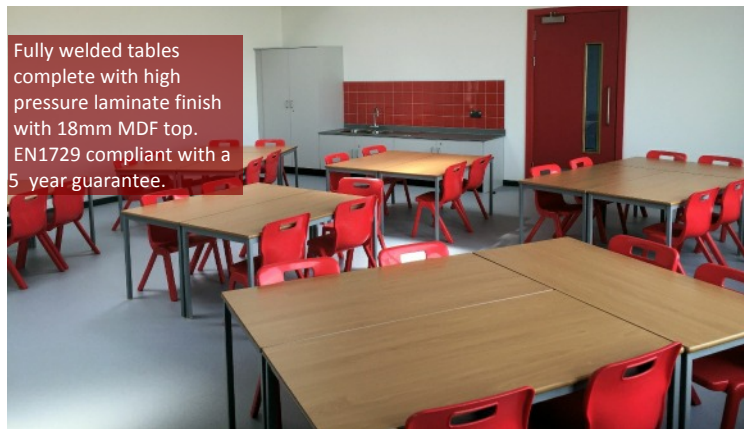
Fully welded tables complete with high pressure laminate finish with 18mm MDF top. EN1729 compliant with a 5 year guarantee.