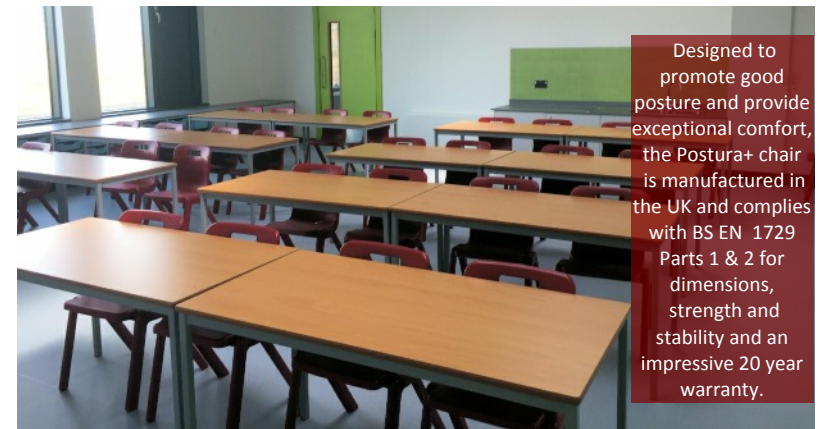
Designed to promote good posture and provide exceptional comfort, the Postura+ chair is manufactured in the UK and complies with BS EN 1729 Parts 1 & 2 for dimensions, strength and stability and an impressive 20 year warranty.