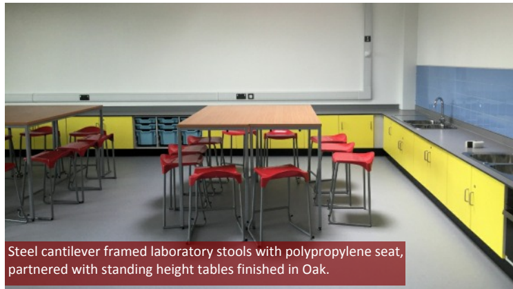
Steel cantilever framed laboratory stools with polypropylene seat, partnered with standing height tables finished in Oak.