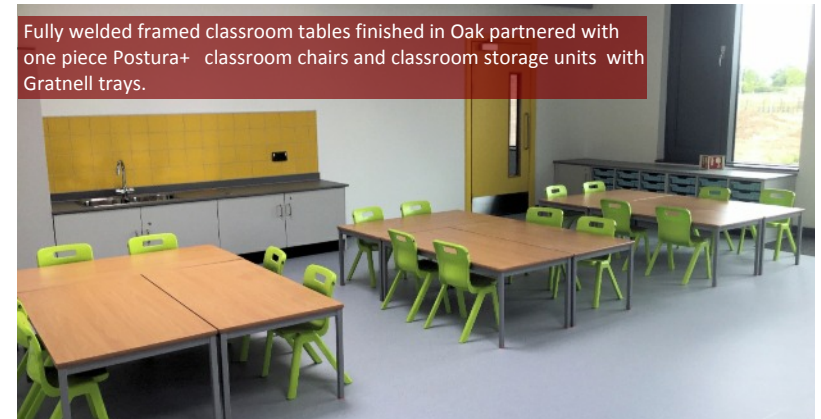
Fully welded framed classroom tables finished in Oak partnered with one piece Postura+ classroom chairs and classroom storage units with Gratnell trays.