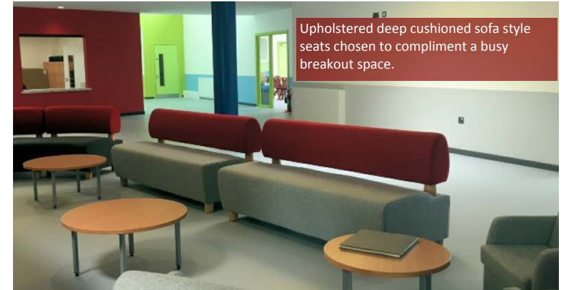
Upholstered deep cushioned sofa style seats chosen to compliment a busy break-out space.